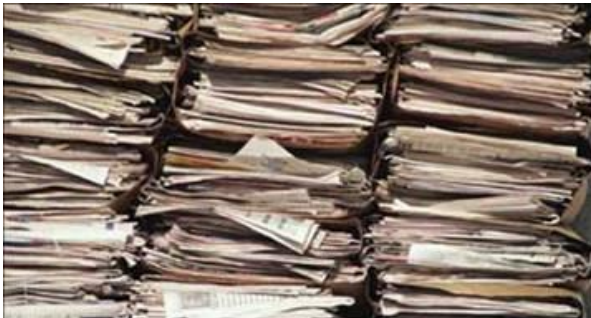
Information folders maintained in Powerpoint