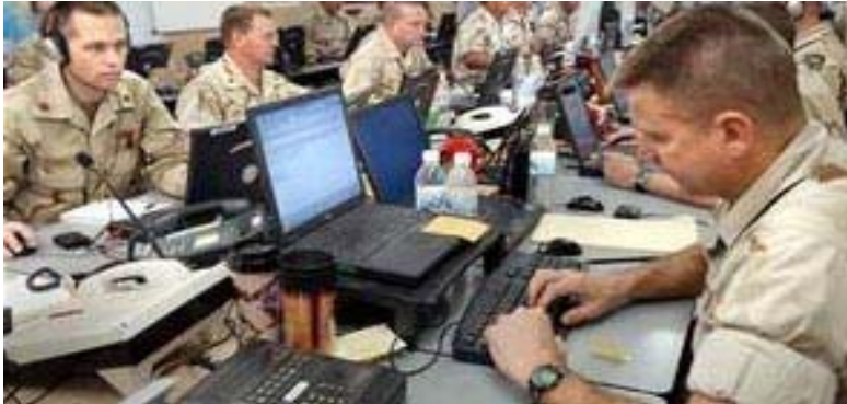
Embassy Intelligence Fusion Center (EIFC)