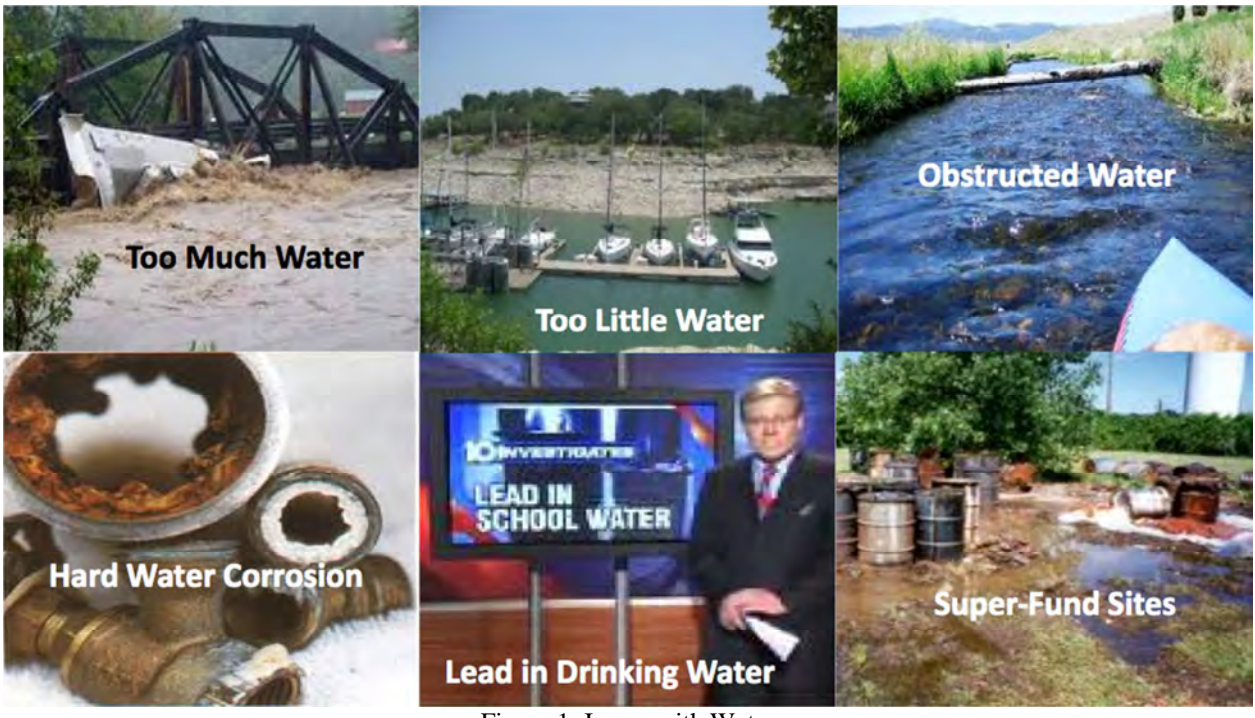
Figure 1: Issues with Water

While some lament the sorry state of developer knowledge and skill at producing invulnerable software, the truth is that most of the issues that can go "wrong" and lead to exploitable vulnerabilities haven't been well known or understood. For context we can look at our analogy of software as water. Many of the quality issues related to water's safe use have been clear to all. For instance, as shown in the top of Figure 1, having too much water in a river makes its use for recreation dangerous, as does too little, or having obstacles near the surface of the water. Likewise, as shown in the bottom of Figure 1, but less obvious to the naked eye, is the hazard of hard water, lead water pipes, or ground water contamination from industrial waste when water is used for consumption, cleaning, or other similar processes.