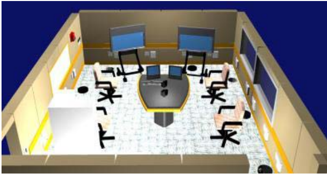
Figure 1: 3D model of the ETR

and-play" user experimentation lab where technology and operational use emerge in an ongoing manner.