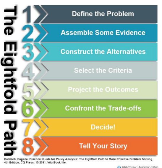
Fig. 2. 8-Step Process for Policy Analysis - Bardach

The Space Policy section of this metamodel provides the context and purpose for the three foundational components and is the keystone for the principles, technical, and vocabulary-based artifacts in ISRA overall. The Space policy component of ISRA must identify the primary producing stakeholder (owner) organizations that will contribute to ISRA and solution architectures that have or will utilize ISRA. It must also describe policy criterion that will be addressed. Understanding and consensus on the space policy criterion of the Reference Architecture will enable end-to-end traceability between organizational context and eventual implementation(s). Commonly accepted and practiced methodologies for policy analysis such as Bardach's 8 steps (Fig. 2) can allow for effectively implemented policy with Ex Ante and Ex Post evaluation mechanisms. Story Telling as the eighth step is critical to effective linkages between policy intent and effect on behavioral norms and standards of practice development. This aspect of ISRA is the most purposefully multi-disciplinary, intended to blend both policy and engineering worlds.