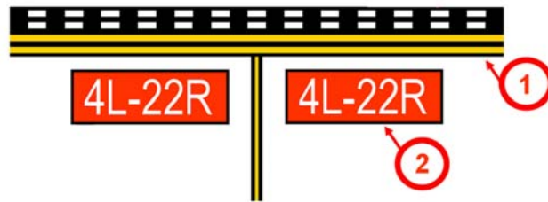
Figure 3. Enhanced Airport Surface Markings Evaluated at BOS.

proposals, the numbers refer to the marking descriptions in the introduction section. Ninety-seven pilots completed surveys after having seen the enhanced markings. Seventy-four of them compared the enhanced markings at BOS with the current marking standard. The other 23 pilots compared the enhanced markings at BOS with the enhanced markings at PVD (see above). A majority of the pilots preferred the enhanced markings over the current markings. Whereas the modification of the hold-short line (white dashes and holdline extended onto the shoulder) was evaluated similarly by pilots in BOS as well as in PVD, the markings that included a modified taxiway centerline (PVD) received overall higher evaluations than the markings without (BOS). In structured interviews pilots indicated that they saw the greatest benefits of enhanced markings for pilots who were unfamiliar with the airport but familiar with the marking enhancements, and who taxied in aircraft that allowed a direct view of the taxiway centerline ahead of them (as opposed to an aircraft with restricted forward visibility).