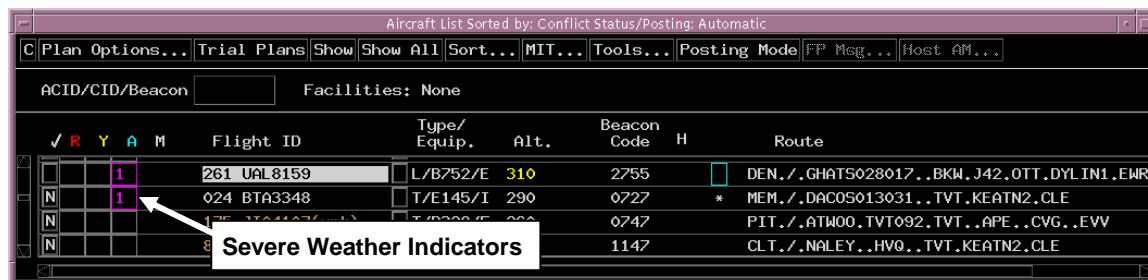
Figure 1. Severe Weather Indicators on the URET Aircraft List

This section describes URET enhancements designed to support the controller in severe weather situations, by displaying areas of current and forecast severe weather, and identifying