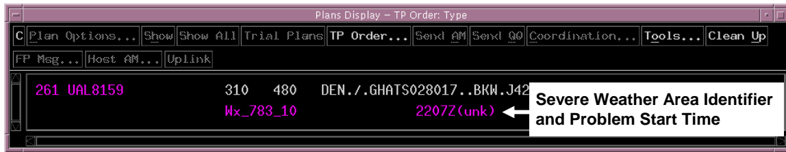
Figure 3. Textual Severe Weather Information

has been modified to search for two maneuvers, one of which initially turns to the left relative to a path proceeding direct from the aircraft's current position to the maneuver end point, and the other which turns to the right. Each maneuver ends at a fix on the current route of flight, with the fix selected to satisfy a maximum turn angle constraint. The controller is free to examine each maneuver and choose the one that is most operationally acceptable, or create an alternative resolution. Maneuver description text is provided on the URET Plans Display to support coordination with the aircraft.