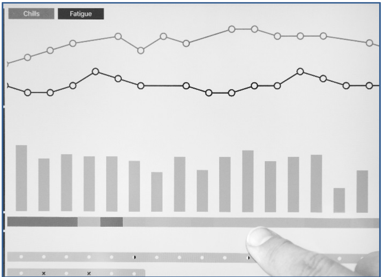
Figure 3. “My Charts” Module in Patient Toolkit