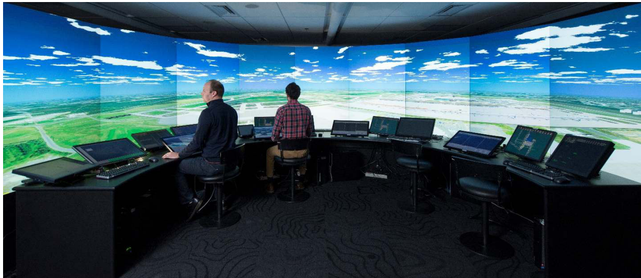
Figure 2: Picture of the Tower environment in the IDEA Lab.

Working in the IDEA Lab together with the Federal Aviation Administration, National Air Traffic Controllers Association, Air Line Pilots Association, civil aviation authorities of various countries, and other organizations, MITRE has helped improve aerospace systems in a number of key areas, such as airspace redesign, controller training prototypes, airport/runway siting, and incorporating UAS into the NAS.