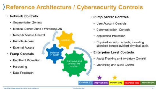
Fig. 3 Reference Architecture / Cybersecurity Controls

Based on this mapping the NCCoE has established a reference architecture and cybersecurity controls for wireless infusion pump systems (Figure 3) that is being adopted in the health sector. This approach has generated joint awareness within the industry of design and protection approaches which have resulted in greater security. In addition, awareness of the need for security controls has convinced some in the infusion industry to find ways to incorporate security features on-board the devices they manufacture.