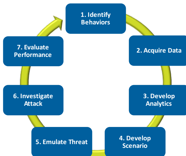
Figure 4. ATT&CK-Based Analytics Development Method

It is important to note that the Blue and Red Teams of the cyber game exercises were held asynchronously from each other for the duration of MITRE’s research. This typically meant performing Blue Team evaluations several weeks after Red Team events. There were several reasons for taking this approach over the more traditional synchronous method. The first was that the research was focused on detecting the adversary, not remediating or attempting to hinder it. In fact, detecting Red Team activity and stopping their behavior in real time would have prevented using the engagement to ascertain multiple ways of detecting the emulated threat. Secondly, asynchronous exercises more accurately emulate the all-too-common real-world situation of defenders not being notified of adversary activity until after the fact. This is often the more challenging case, as defenders usually have little indication of the time ranges on which to focus their search.